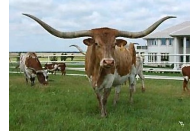
BL FANTOM CHEX