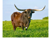
TX W Lucky Lady