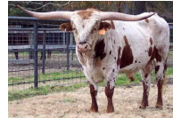
JC's Sugar & Spice