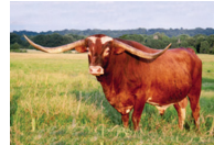
SUPER DOLLY 306