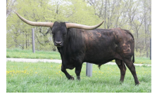
B. C. LUCKY LADY